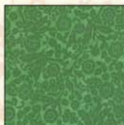
J7051 Green #8