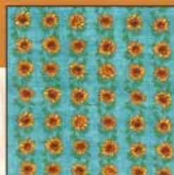
J7026 Brooke #329