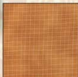
G8565 Goldenrod #455

HOFFMAN FABRICS CALIFORNIA-INTERNATIONAL