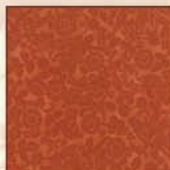
J7051 Rust #39