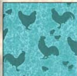
J7025 Brooke #329