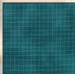
G8565 Teal #21