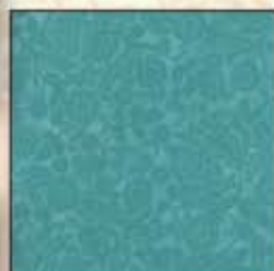
J7051 Dusty Teal #D21