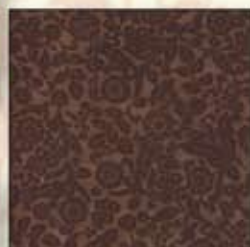
J7051 Brown #6