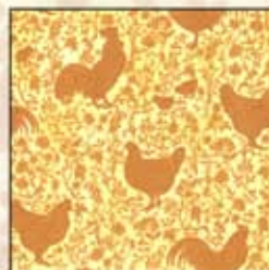
J7025 Buttercup #471