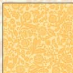
J7051 Buttercup #471