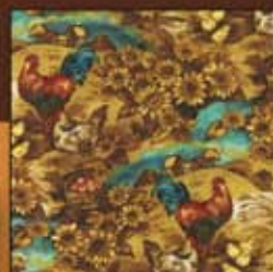
J7024 Buttercup #471