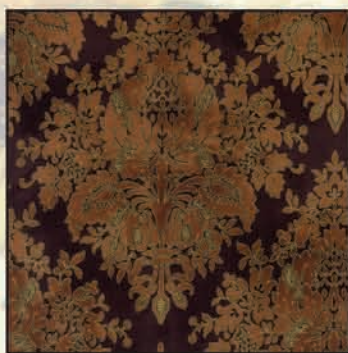
K7163 Brown Gold #6G