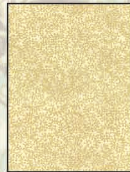
J9216 Cream Gold #33G

View swatches and download quilt patterns at www.hoffmanfabrics.com