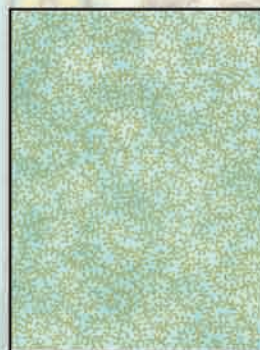
J9216 Seafoam Gold #79G