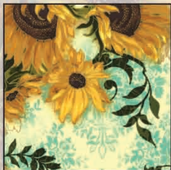
K7160 Sunflower Gold #150G