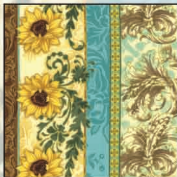
K7161 Sunflower Gold #150G