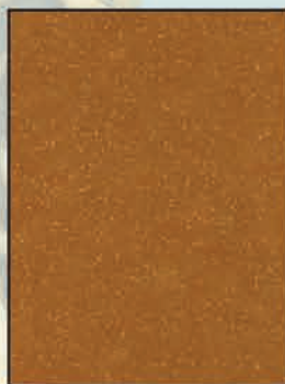
G8555 Gold Gold #47G