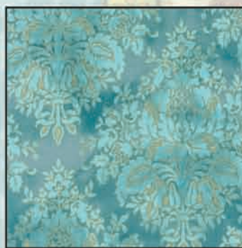
K7163 Dusty Teal Gold #D21G