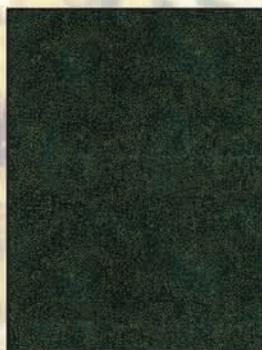
G8555 Hunter Gold #60G