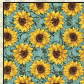
K7162 Dusty Teal Gold #D21G