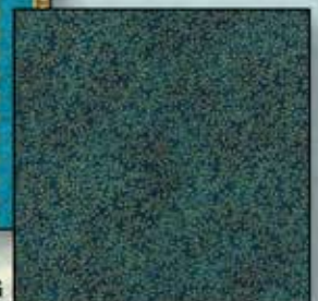
J9216 Teal Gold #21G