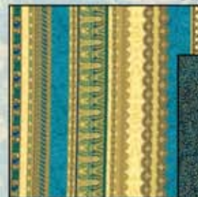
J9234 Sapphire Gold #230G