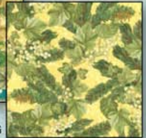
J9229 Gold Gold #47G