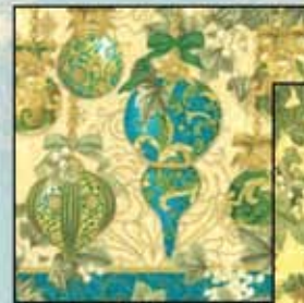
J9228 Sapphire Gold #230G