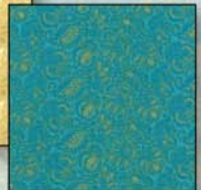
J9232 Sapphire Gold #230G