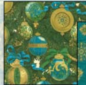
J9230 Sapphire Gold #230G