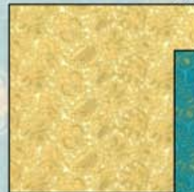
J9232 Gold Gold #47G