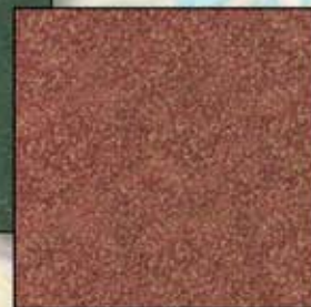
J7032 Burgundy #38G

To see more quilts designed by Larene go to www.thequiltedbutton.com