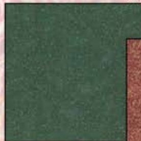
G8555 Pine Gold #141G