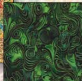
J7029 Green Gold #8G