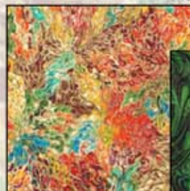
J7030 Multi Gold #130G