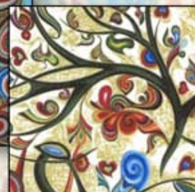
J7031 Multi Gold #130G