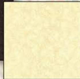
G8555 Ivory Gold #22G