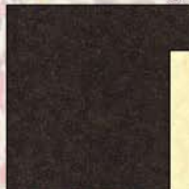
G8555 Bark Gold #407G