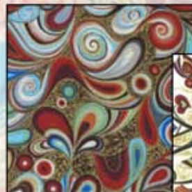
J7028 Multi Gold #130G