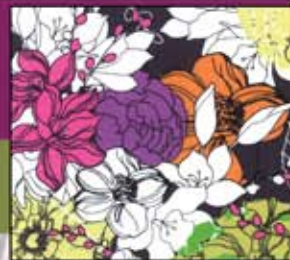
J3225 Dahlia #453

Featuring the Modern Blooms Collection by Hoffman California Fabrics