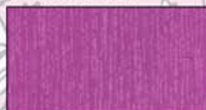
J9002 Orchid #223