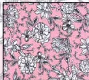
J3227 Pink #12