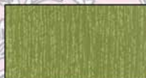
J9002 Olive #96