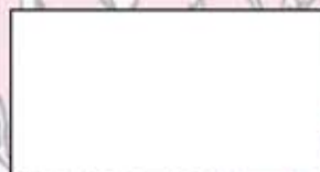
J9002 White #3