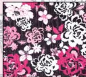
J3226 Pink #12