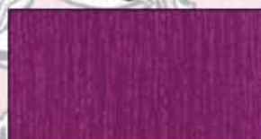
J9002 Magenta #72