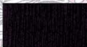
J9002 Black #4