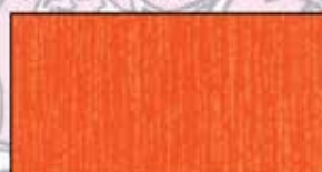
J9002 Orange #13