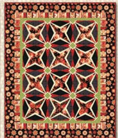
Red color way