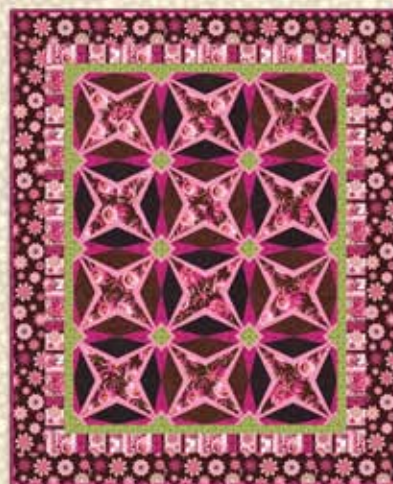
Fuchsia color way

View us! http://hoffmanfabrics.com/ Like us! www.facebook.com/HoffmanCaliforniaFabrics Follow us! https://twitter.com/#!/HoffmanFabrics Pin us! http://pinterest.com/hoffmanfabrics/